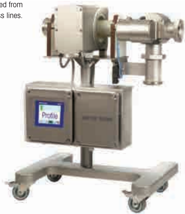
L Series Profile Pipeline detector mounted on mobile stand

L Series Pipeline detectors are also able to find non-spherical contaminants such as wire, swarf and slithers of metal - the most difficult contaminants to detect. Advanced software provides exceptional levels of in-process stability resulting in reliable, on-line performance and minimised product waste due to the elimination of false triggering and the loss of good product.